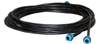
Pair of Wire conduits 1 off