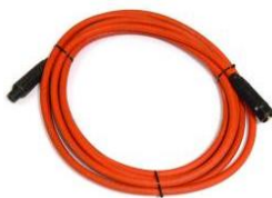
Power cables 2 off