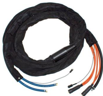
Power cables / air hose manifold / air-cooled cables and control cable