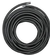
Air hose 1 off