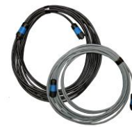
Motor drive cable 1 off