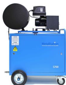
Energiser, MIG dispenser and push/pull drive unit

Most commonly used for on-site anti-corrosion where the handling of drums is not easy.