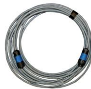
Control cable 1 off