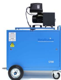
Energiser and push/pull drive unit