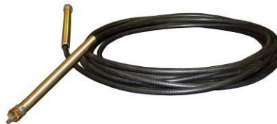
Flexible Drive 1 off